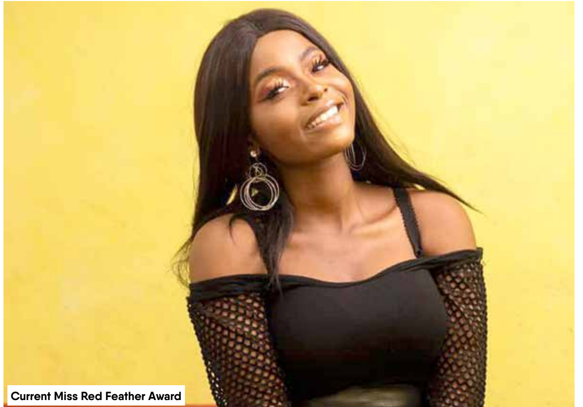
Current Miss Red Feather Award

“I am so proud of what we are able to do, of what we are proposing to our people and to the world at large. As a matter of fact, when I learned some of our movies were being selected for Netflix, I was like, and this is it, one more recognition. I guess many joined us in celebrating the Oscar nomination of one made in Cameroon movie.